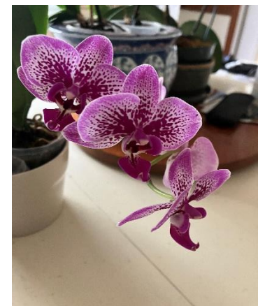
POS $8 Phal