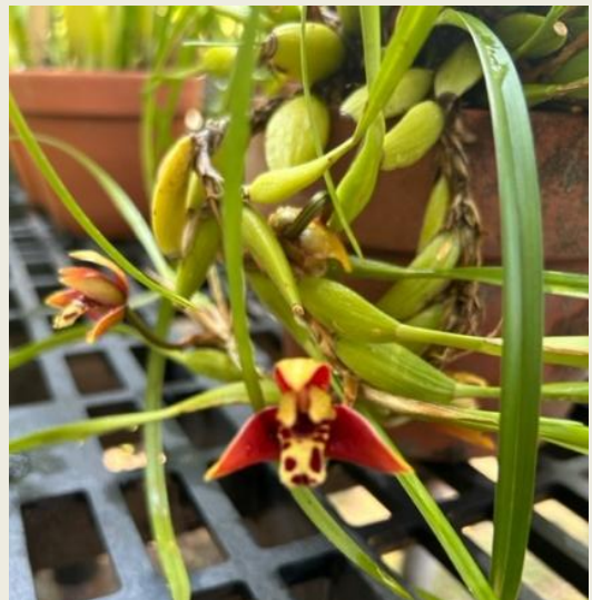
Debbie Dillon-Townes' Maxillaria tenuifolia