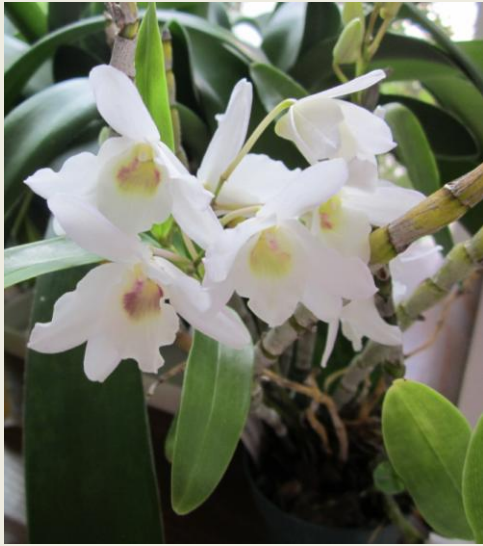
Becky Tupper's Dendrobium Ise 'Colorful' x Angel Baby 'Newberry'