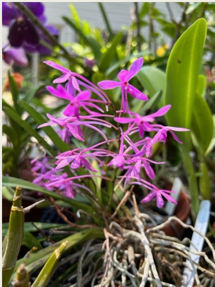
Debbie Dillon-Townes' Ascofinetia Cherry Blossom