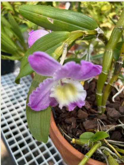
Debbie Dillon-Townes' Nobile Dendrobium