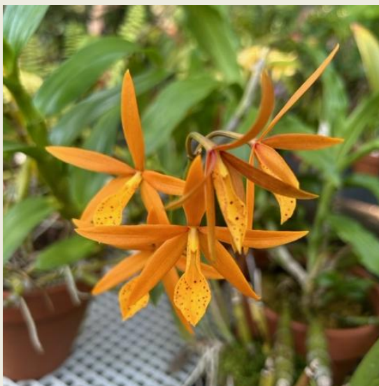
Debbie Dillon-Townes' Bpl. Golden Peacock 'Orange Beauty'