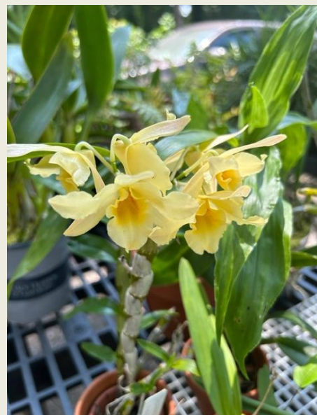
Debbie Dillon- Townes' Nobile Dendrobium