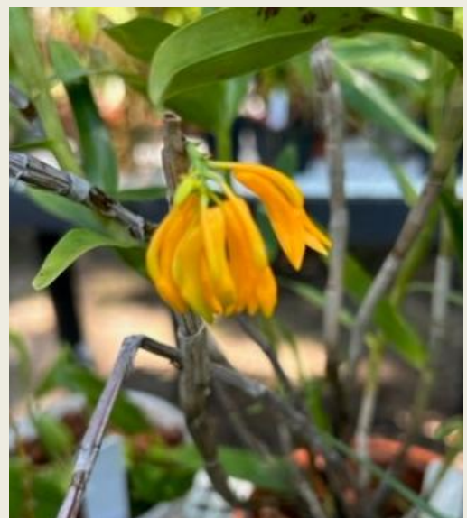
Debbie Dillon-Townes' Dendrobium topaziacum