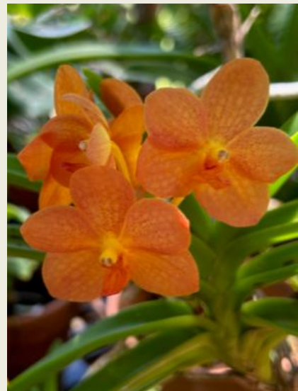
Debbie Dillon-Townes' Ascocenda Su Fun Beauty 'Orange Belle'