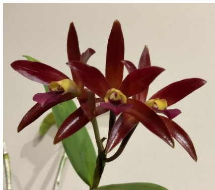
C. Chocolate Drop Kodama