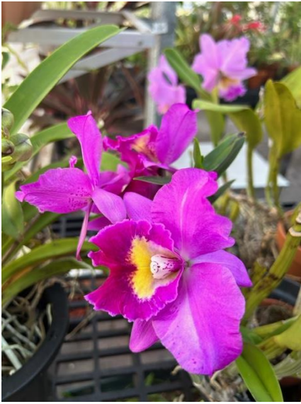
Pot. Hsinyng Pink Doll 'Hsin Ying'