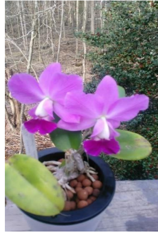
BC Tropical Beauty "Hawaii"