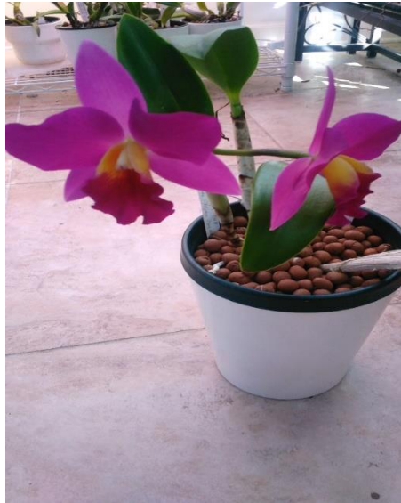
C Purple Doll