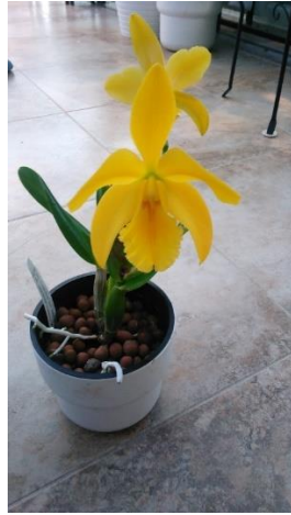
C "Guess What SVO"