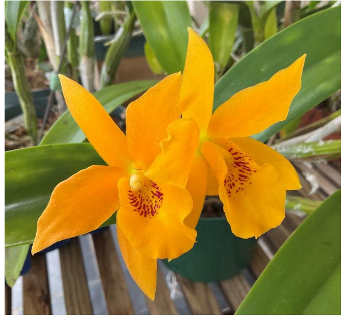
C Gold Digger "Butter Cup"