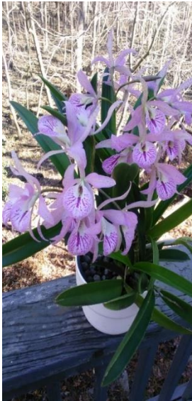
BC Makai "Musami"