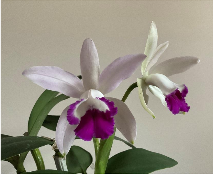
Tag is deep in the pot