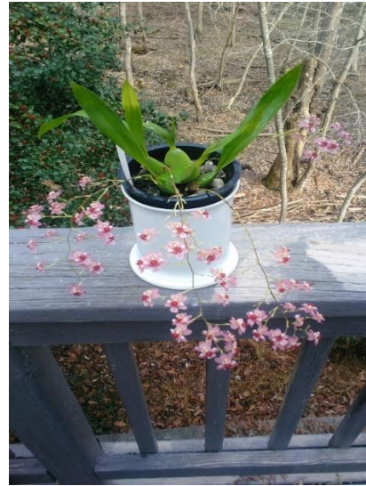
Onc Twinkles pink