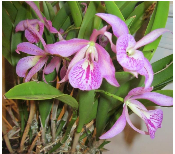
Bc Maikai "Mayumi"