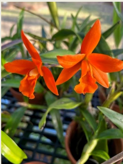
Debbie Dillon-Townes' Blc. Orange Treat 'NN'