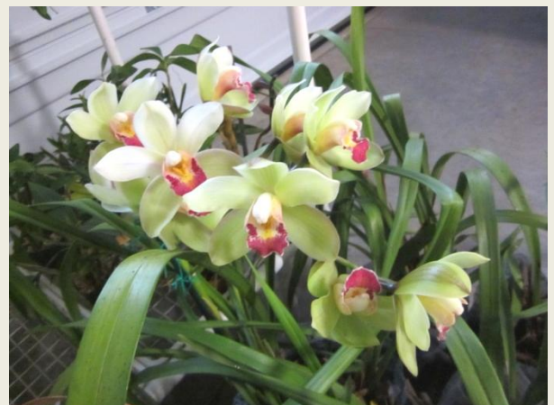
Becky Tupper's Cymbidium Summer Ice 'Judith'