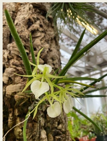
Debbie Dillon-Townes' Brassavola nodosa