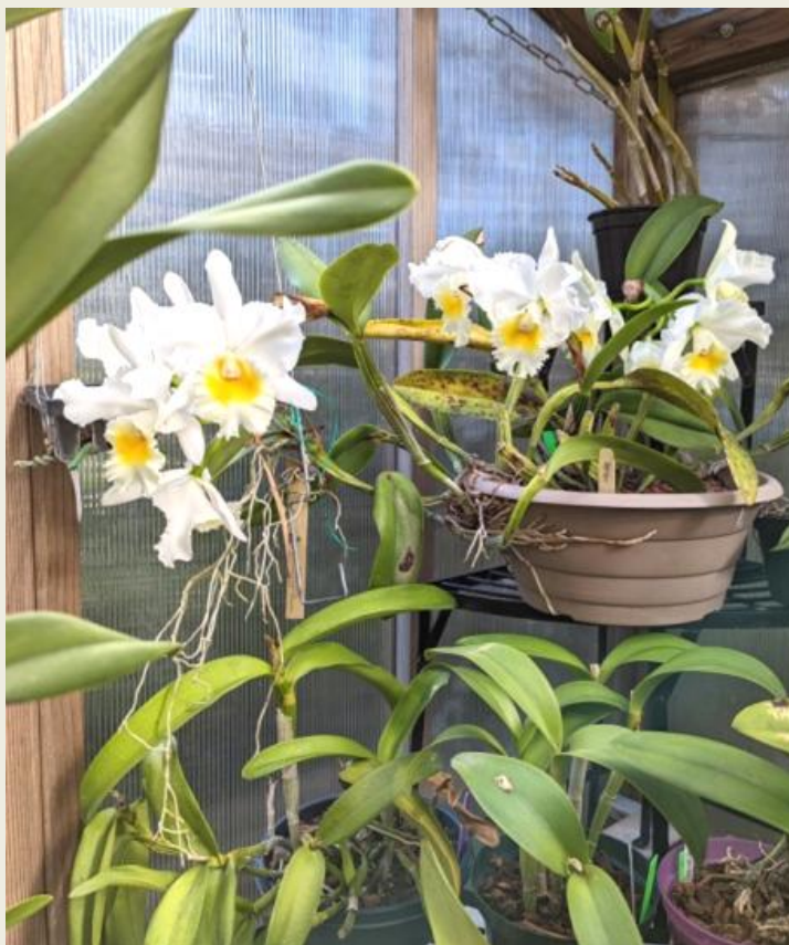
Betty Hicks' Cattleya Gertrude Rounds 'NN' with 11 flowers!