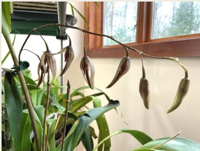
Another view of Carolyn's Stellis