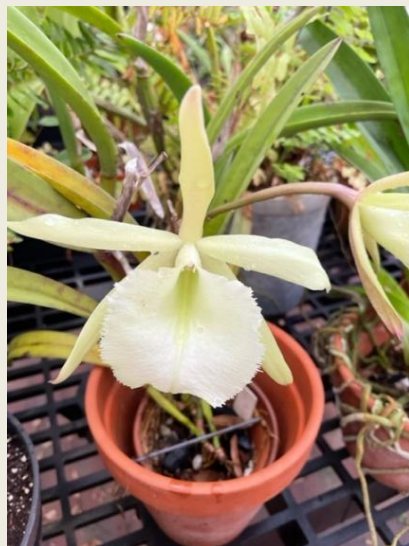
Debbie Dillon-Townes' Brassavola hybrid