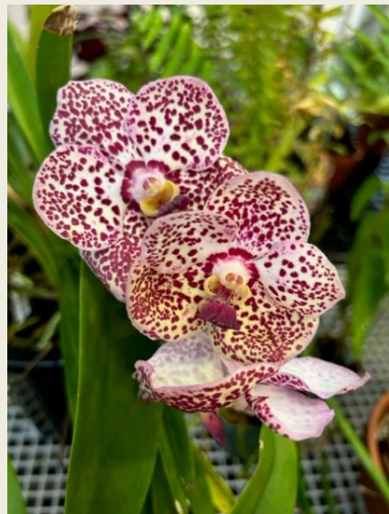
Debbie Dillon-Townes' Vanda Kulwadee Fragrance