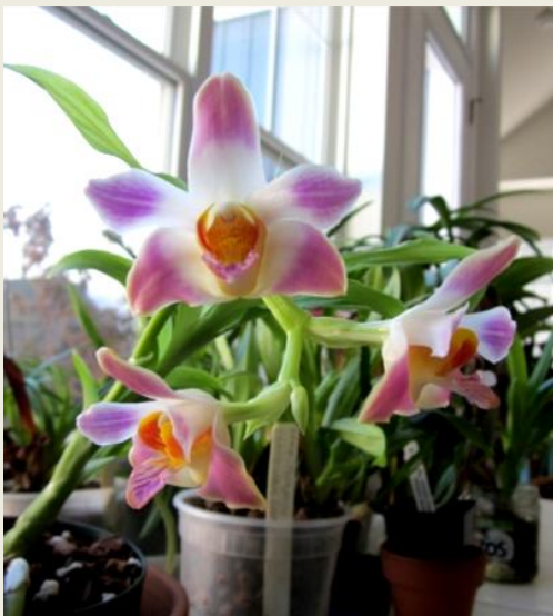
Becky Tupper's Chysis limminghei