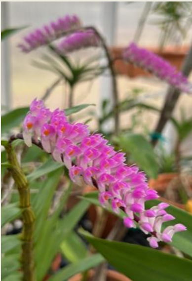
Debbie Dillon-Townes' Dendrobium secundum