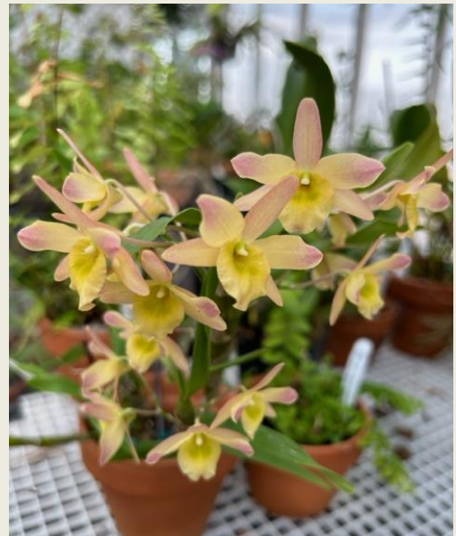
Debbie Dillon-Townes' Dendrobium Spring Bird 'Kurashki'