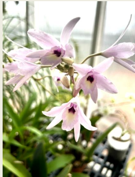
Debbie Dillon-Townes' Laelia rubescens