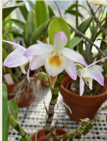
Debbie Dillon-Townes' Dendrobium Gold Star x Princess