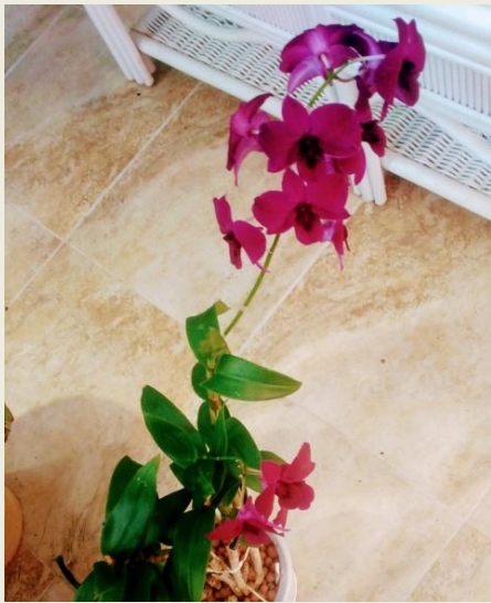
Joyce Carpenter's Dendrobium Poper Red