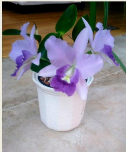
Joyce Carpenter's Lc. Final Blue