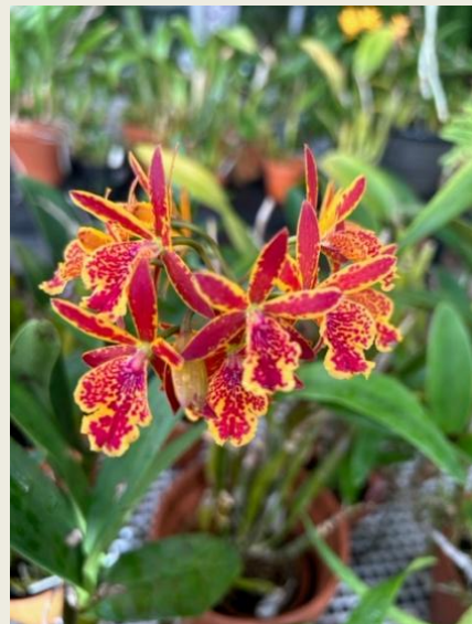
Debbie Dillon-Townes' Epicattleya Volcano Trick 'Orange Fire'