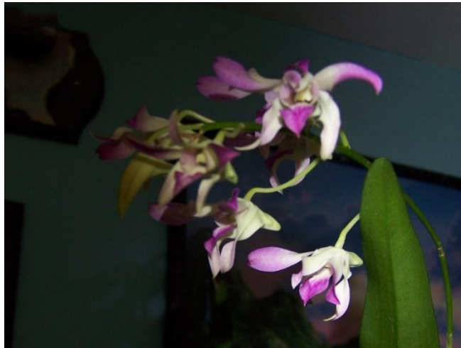
Den Pink Antelope