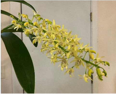
Yellow Den speciosum