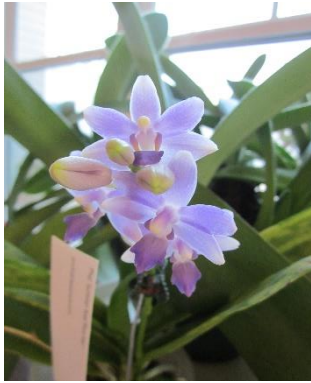
Phal Summer Rose "Blue Star"