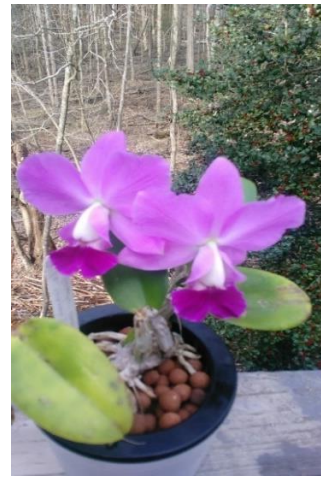
BC Tropical Beauty "Hawaii"