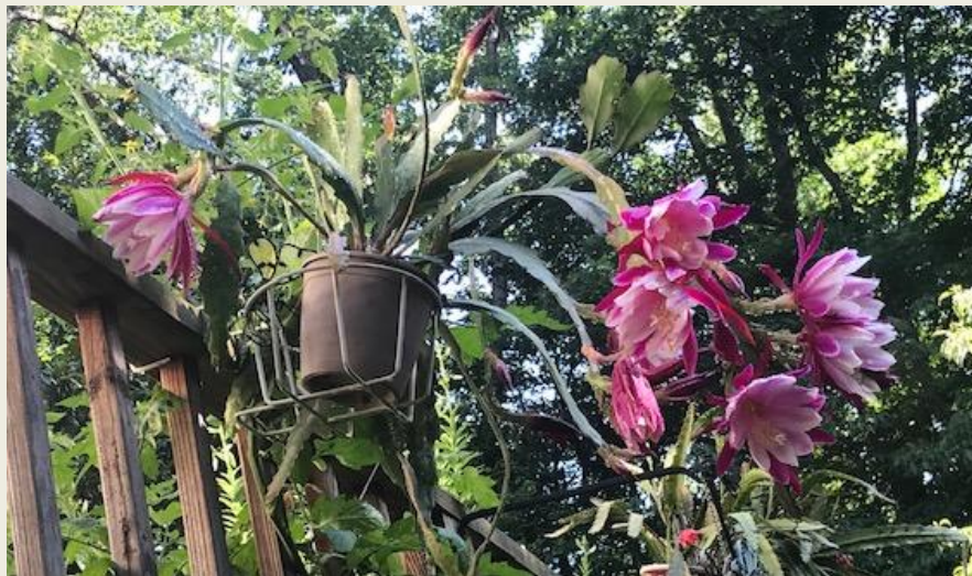
Gisela Fashing's Orchid Cactus

Summertime brings blooms from nice orchid companion plants too!