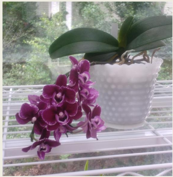
Joyce Carpenter's Phalaenopsis

Summertime brings blooms from nice orchid companion plants too!