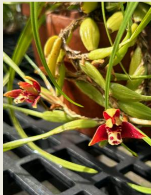
Debbie Dillon-Townes' Maxillaria tenuifolia