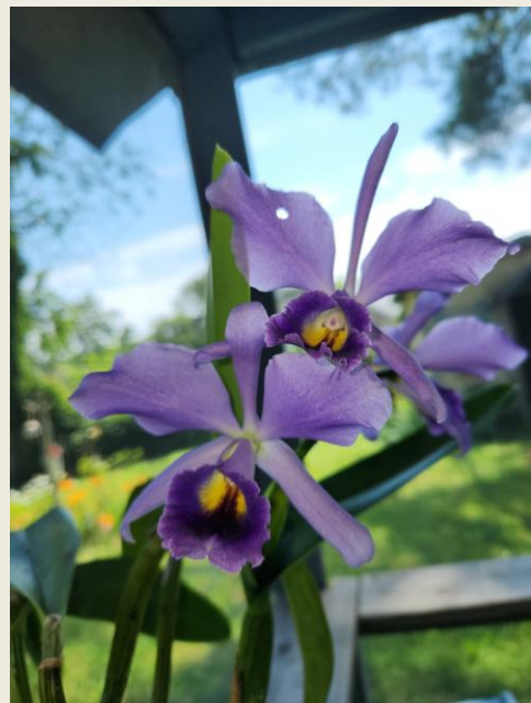
Roseann Wade's Lc. Blue Boy 'Gainesborough' HCC/AOS