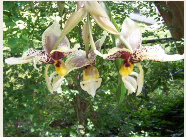
Close-up of the flowers