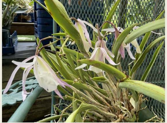
Brassavola Maria del Carmen x Cattleya maxima var. concolor