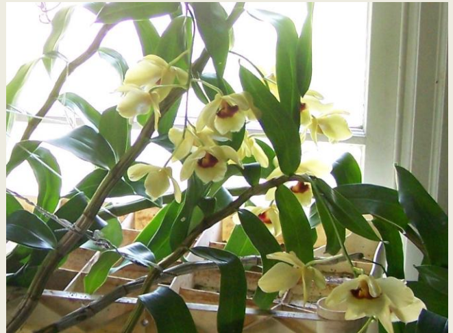
Jim Pajot's Dendrobium The entire plant measures about 4 feet across.