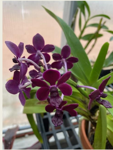
Debbie Dillon-Townes' Rhynchostylis hybrid