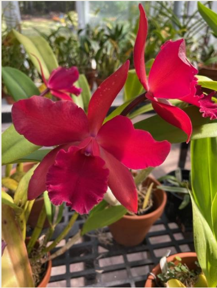
Debbie Dillon-Townes' Potinara San Damiano x Chocolate Drop 'Doris'