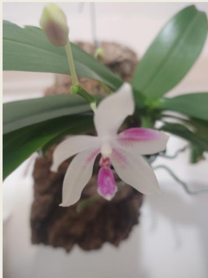
Peggy Rogers' Phalaenopsis fimbriata