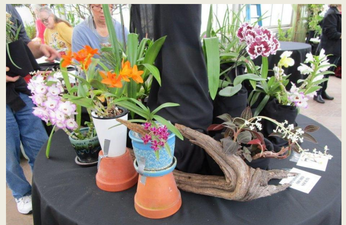
POS display in progress