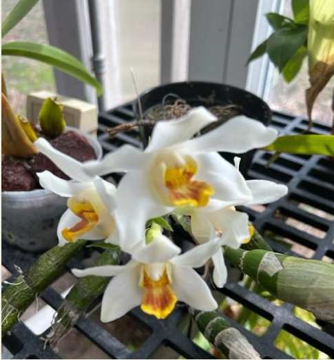
Debbie Dillon-Townes' Chysis bractescens