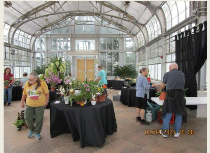
Orchid societies and vendors set up in the exhibition hall