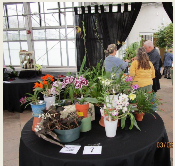
Another angle of POS display in progress