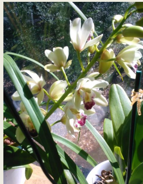
Joyce Carpenter's Cymbidium Sweetheart 'Sensation'