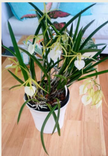
Joyce Carpenter's Brassavola Little Stars