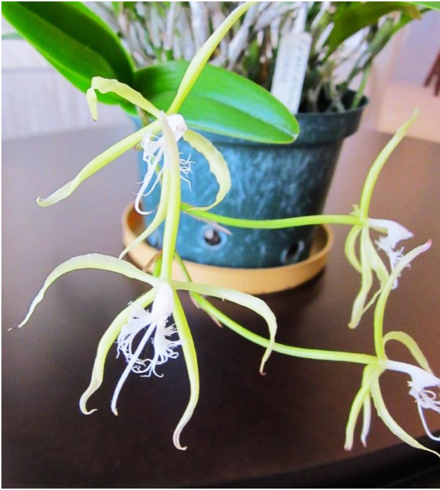
Coliostylis ciliaris close-up