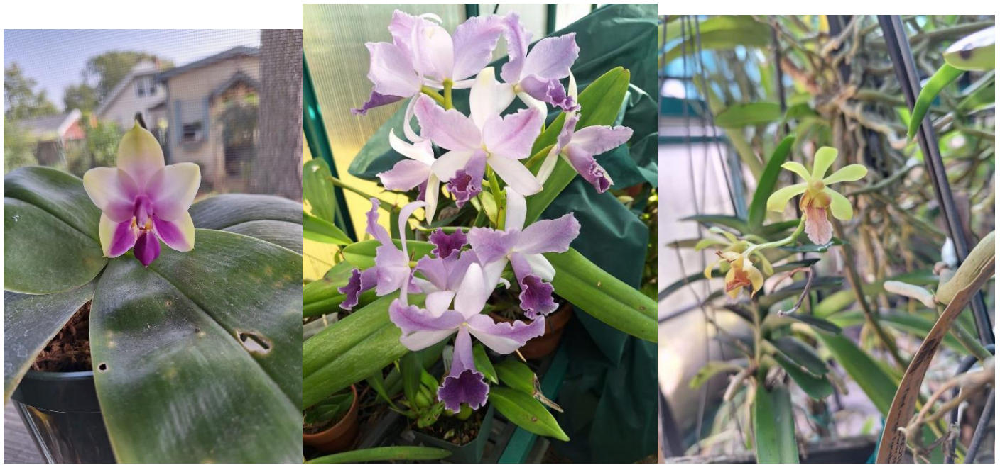
LC Blue Boy