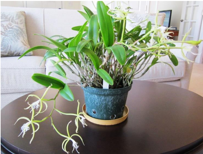
Coliostylis ciliaris full view