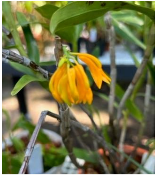
Debbie Dillon-Townes' Dendrobium topaziacum