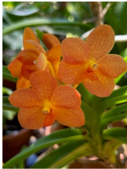
Debbie Dillon-Townes' Ascocenda Su Fun Beauty 'Orange Belle'