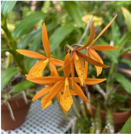
Debbie Dillon-Townes' Bpl. Golden Peacock 'Orange Beauty'