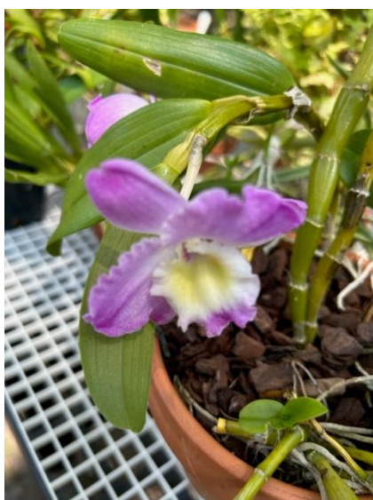
Debbie Dillon-Townes' Nobile Dendrobium