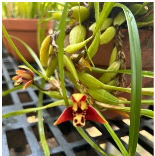
Debbie Dillon-Townes' Maxillaria tenuifolia