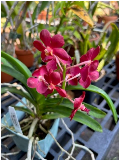
Debbie Dillon-Townes' Ascda. Sweet Pea 'Ruby' HCC/AOS