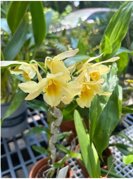
Debbie Dillon- Townes' Nobile Dendrobium