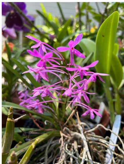
Debbie Dillon-Townes' Ascofinetia Cherry Blossom